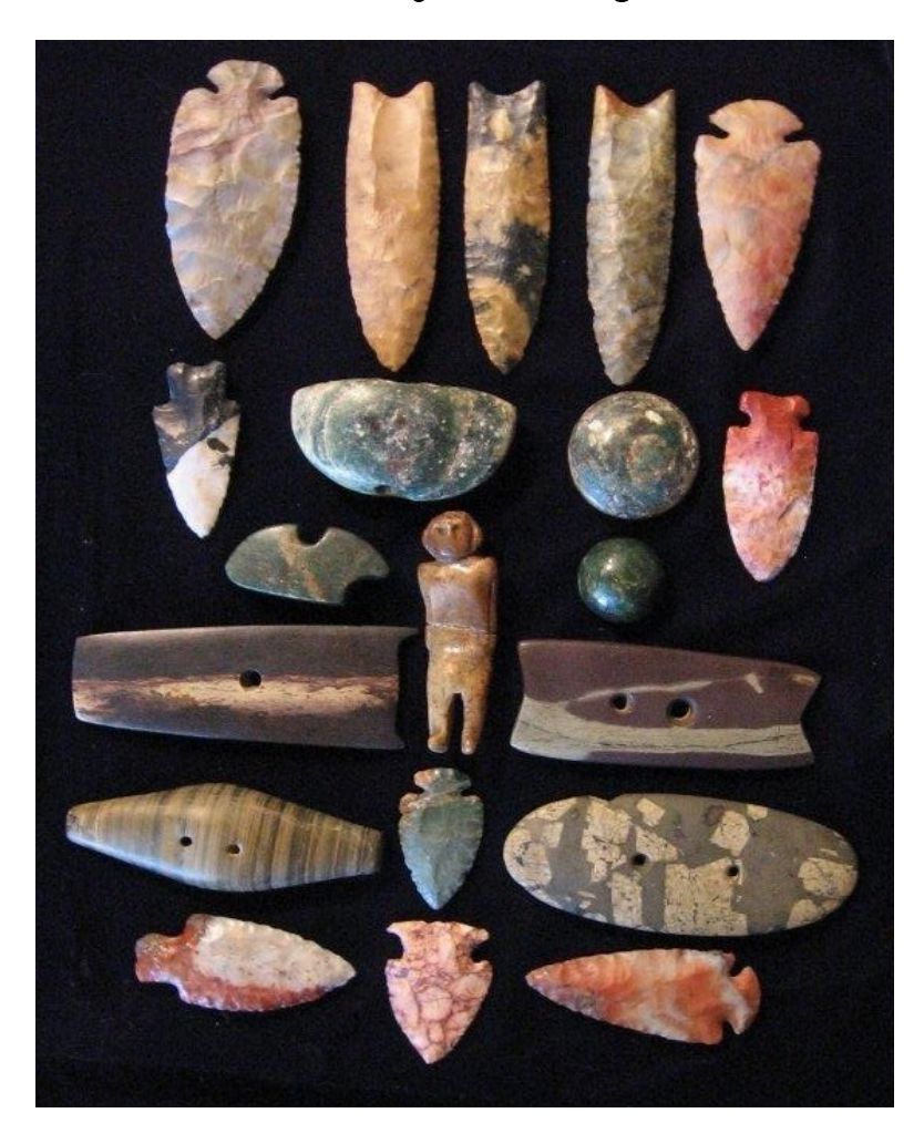
The ARCHAEOLOGICAL SOCIETY OF OHIO